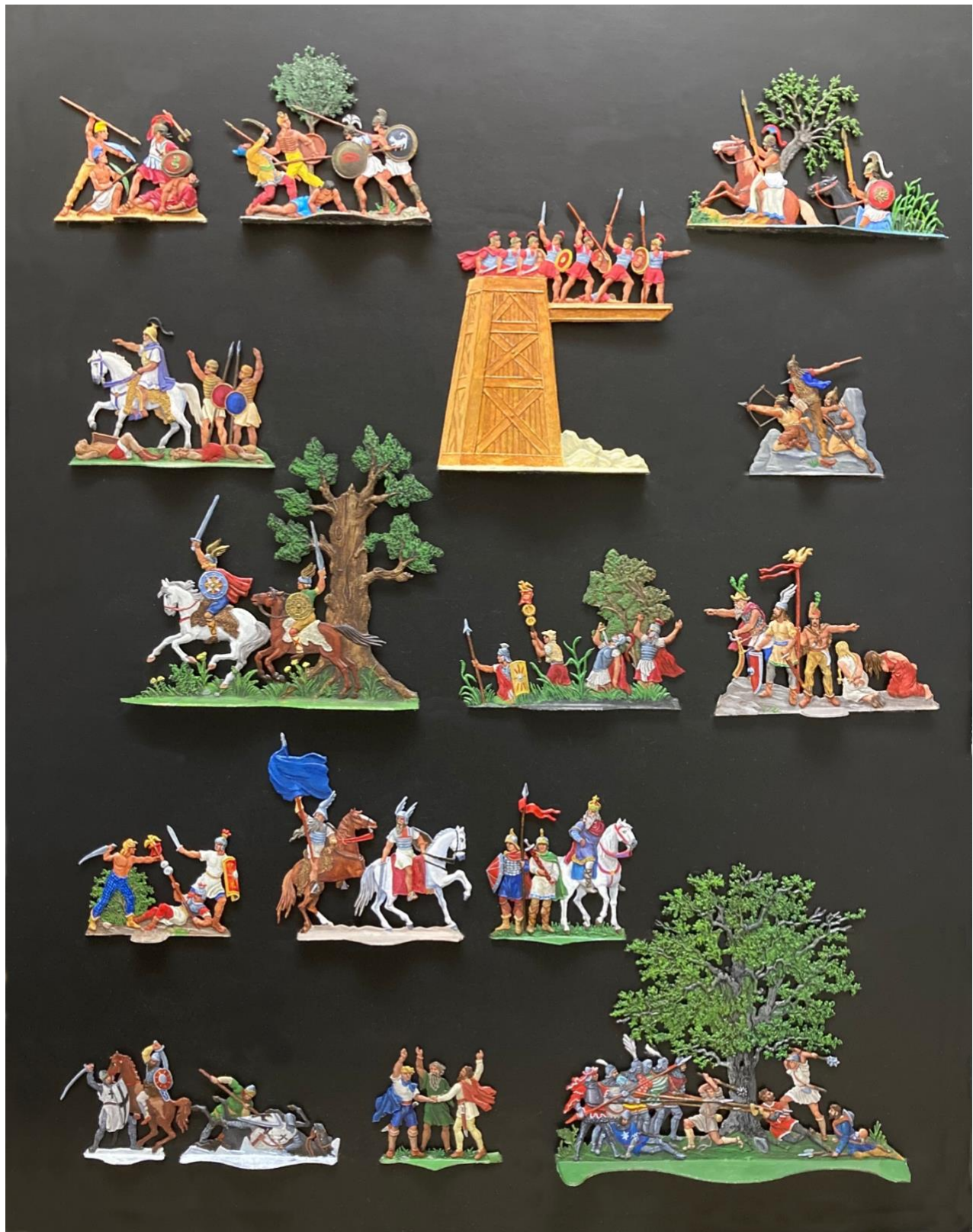
History through a German “Flats” Lens, with Something of a Russian Slant